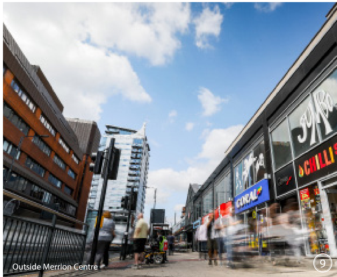
Outside Merrion Centre

You'll never be lost for things to do and places to visit, for example, you might want to visit one of the museums, spend the day at one of the sports centres, or go to a local park and enjoy the great outdoors as well as having a change of scenery while studying.